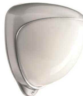
D-TECT 40 / 50

Dual technology Microwave/ PIR external detector